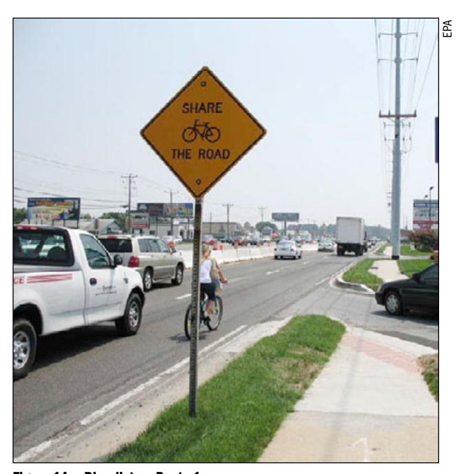
Figure 14. Bicyclist on Route 1.