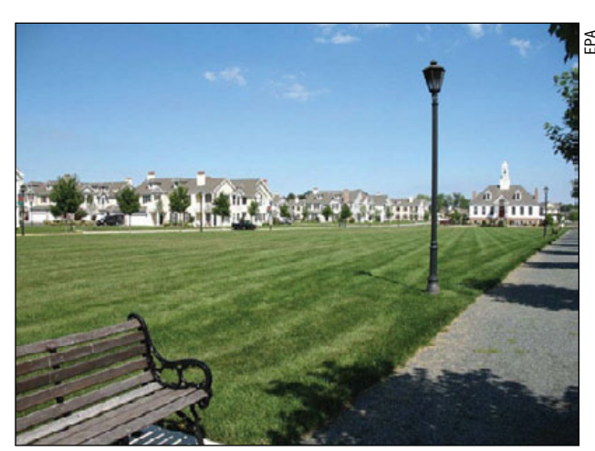
Figure 11. The town green at Paynter's Mill, a recent development in Sussex County.