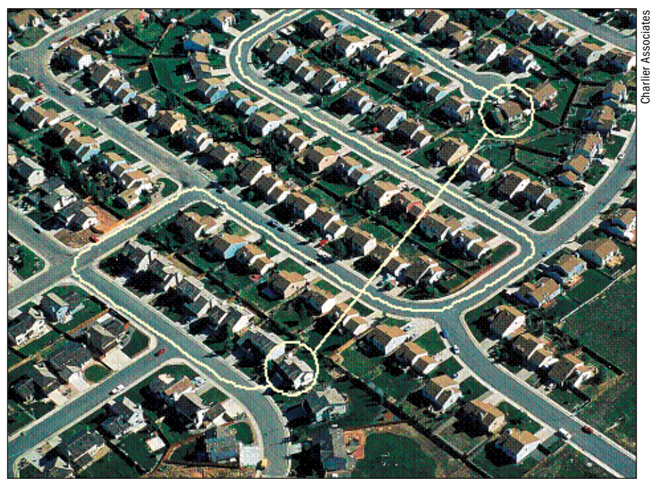
Figure 12. Many suburban developments are being designed in ways that make trips longer and make it difficult for residents to walk or bike.

the arterials, emergency responders can't take a different route if the main road is congested.